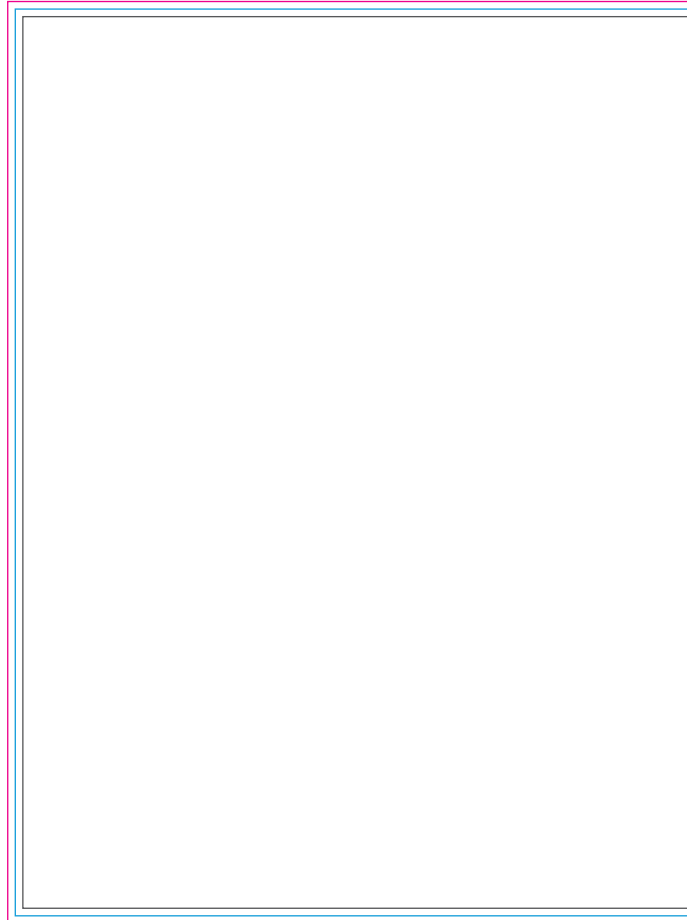
Side 1 900MMW x 1200MMH

— Image Safety Line — Bleed Line — Finished Size