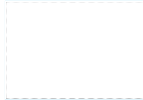
Full Wall 2930MMW x 2060MMH