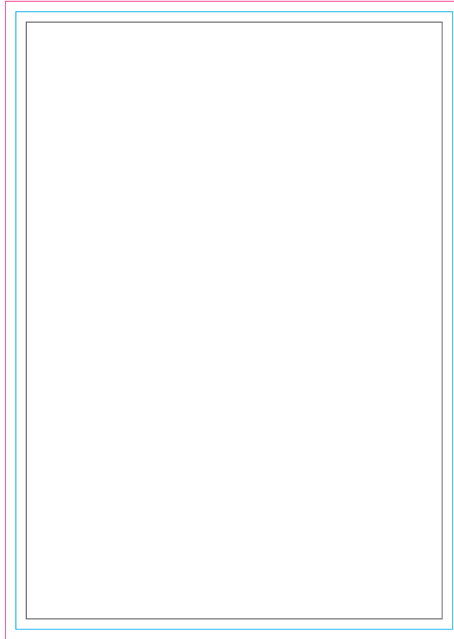
Side 1 420MMW x 594MMH

— Image Safety Line — Bleed Line — Finished Size